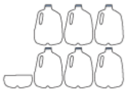
The average dairy cow produces 6.3 gallons of milk per day!

U.S. dairy farms produce roughly 21 billion gallons of milk annually.